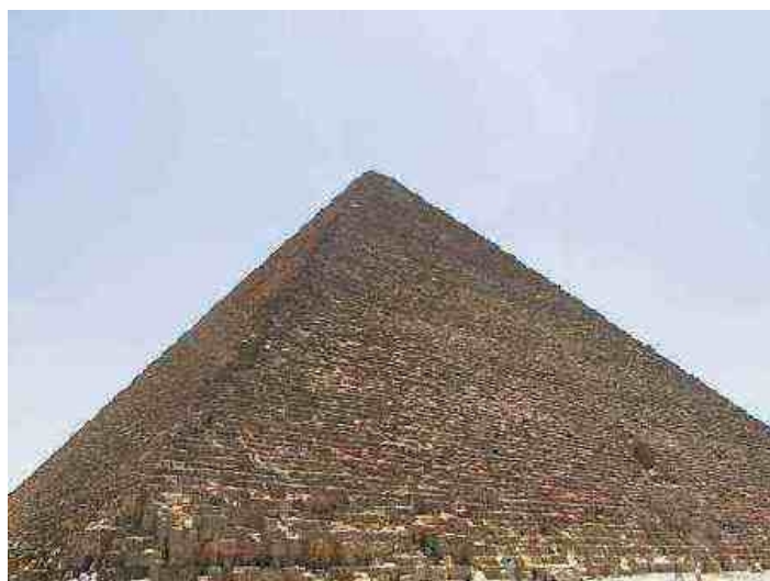
Alien data from Egypt to New Mexico